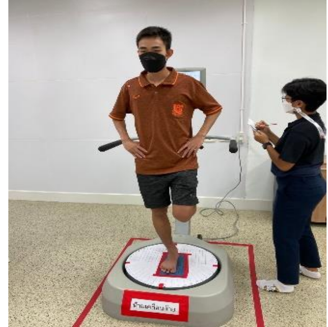
Figure 6. Cognitive-Motor Dual-Task. Single leg standing on unstable platform while counting back by seven from 100, Serial Sevens, represented a Motor-Cognitive Dual-Task performance.