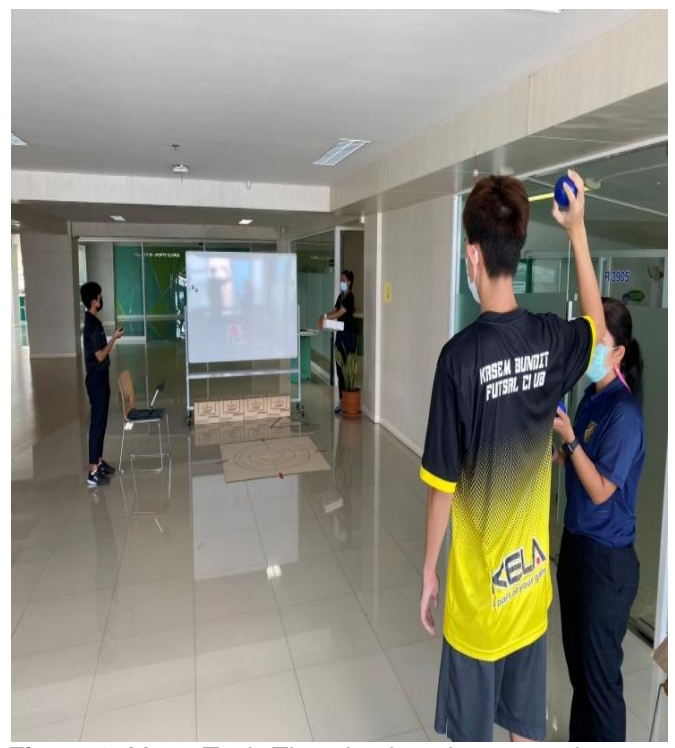
Figure 2 . Motor Task .Throwing beanbag towards target represented another Motor Single Task.