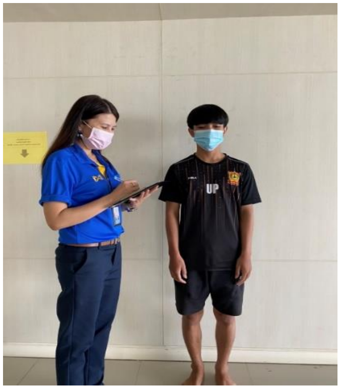
Figure 4. Cognitive task. Counting back by seven from 100, aka. Serial Sevens, represented a Cognitive Single Task.