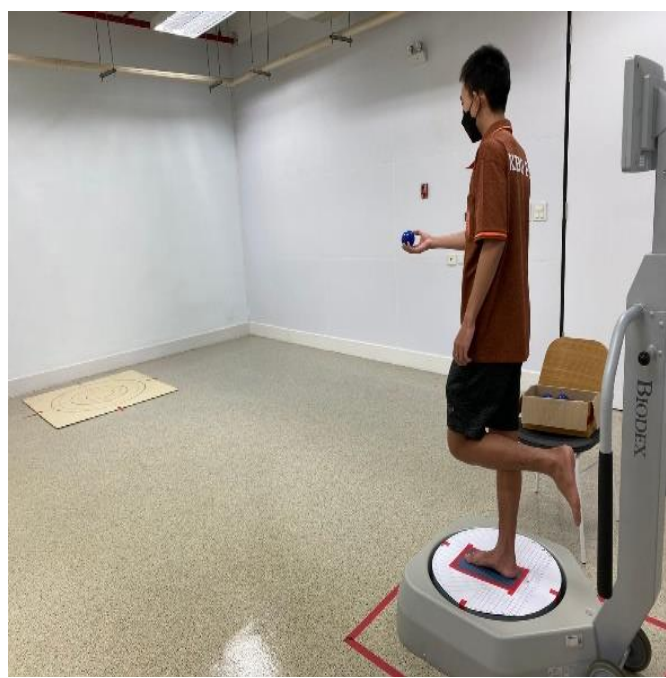
Figure 5. Motor-Motor Dual-Task. Single leg standing on unstable platform while throwing beanbag represented a Motor-Motor Dual-Task.