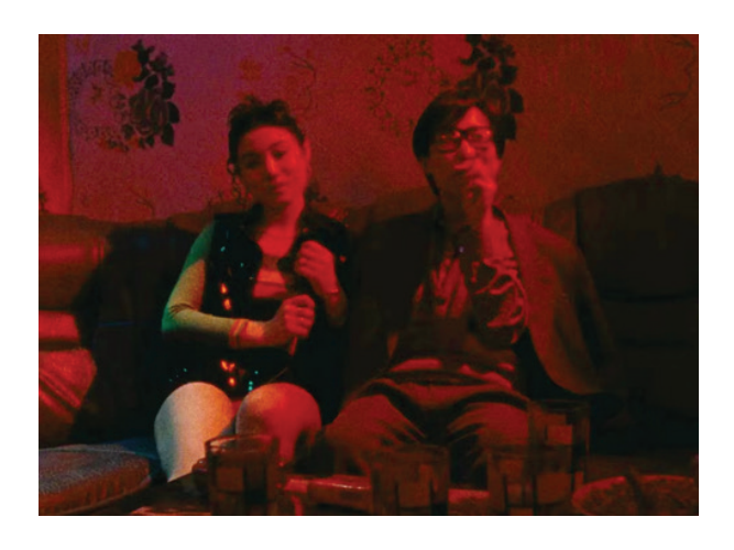
Xiao Wu( 1998)

In Xiao Wu(Jia Zhangke 1998), Xiao Wu comes to the big Shanghai karaoke in a small town to have fun. In a KTV room with dark red lights, he sings Heart Rain with Hu Meimei, a singing girl. The dark red ambiguity becomes the emotional link between Meimei and Xiaowu. The two struggled at the bottom, and their dark lives sprouted some color because they met each other.