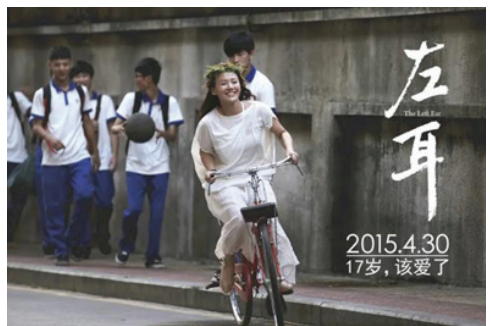
The Left Ear(2015)