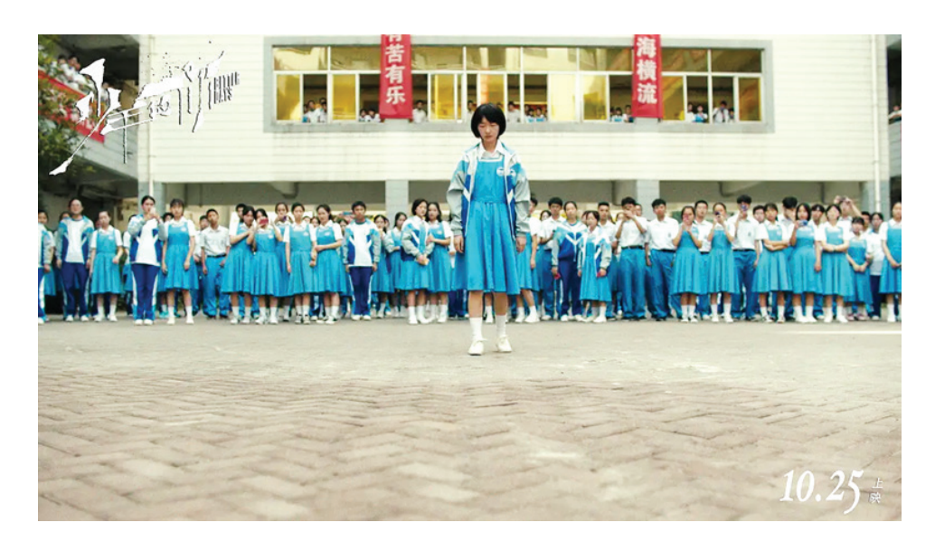
Better Days (2019)